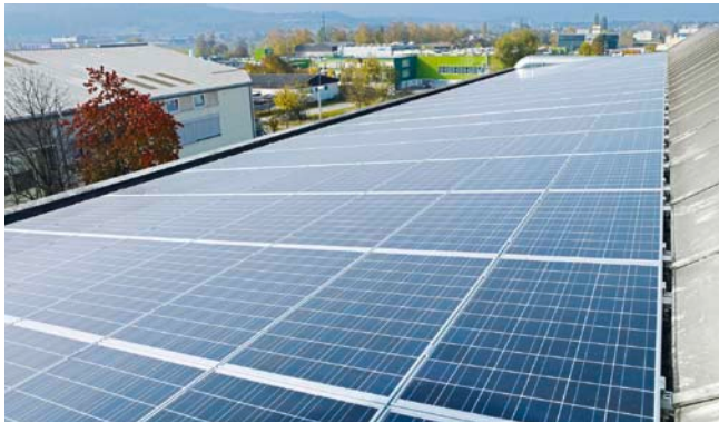
Photovoltaic solar panels