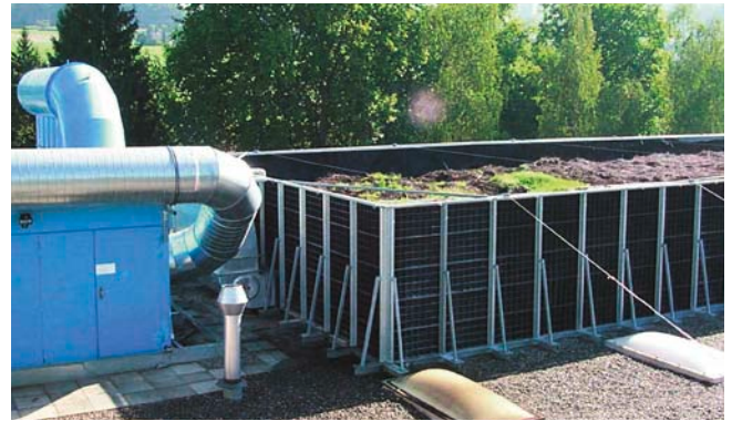
Biofilter plant on the factory roof